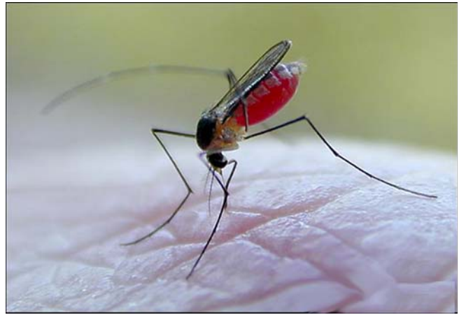
Figure 6. Adult mosquito bloodfeeding

Mosquitoes transmit a large number of diseases, some with minor consequences, and others, like malaria and dengue, that extract an immense toll in terms of loss of life, incapacitation, human suffering and economic losses. For example, malaria is one of the most serious public health problems in the world today. According to the World Health Organization, between 350 and 500 million clinical cases of malaria occur every year, resulting in 1-3 million deaths per year. Approximately 60% of the cases and 80% of the deaths occur in sub-Saharan Africa. Below is a