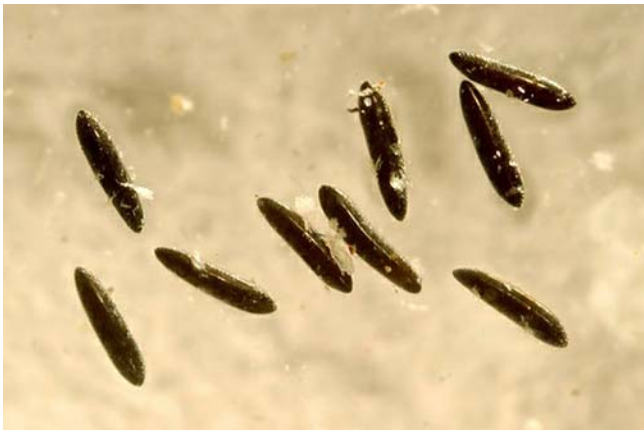
Figure 2. Mosquito eggs.

Eggs - Depending upon the particular species, the female mosquito lays her eggs either individually (Figure 2) or in groups called rafts. Any water-holding area, such as tree holes, ponds, puddles, ditches and artificial containers such as discarded tires and flower pots can serve as a mosquito breeding site.