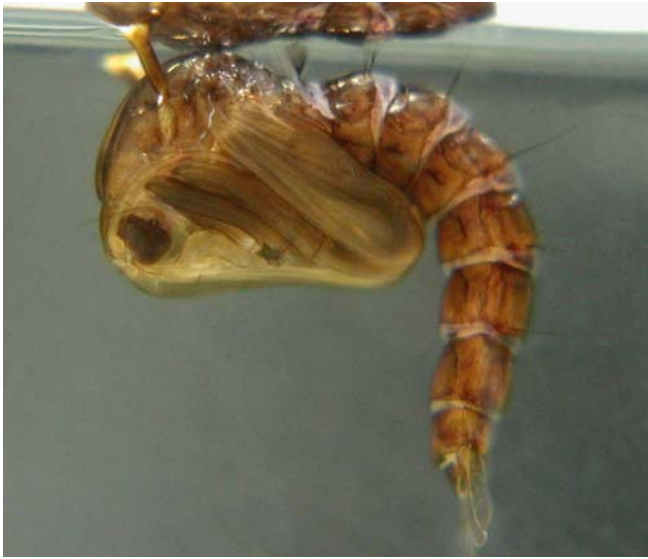
Figure 4. A mosquito pupa ( Toxorhynchites sp.)

male's life span is much shorter. Both adult male and female will feed on nectar and plant fluids, but it is only the female that will seek a blood meal, which most species need in order to develop their eggs. Female mosquitoes lay multiple batches of eggs and most species require a blood meal for every batch they lay. Females of some species can develop a limited number of egg batches (usually 1) without taking a blood meal, a quality known as "autogeny".