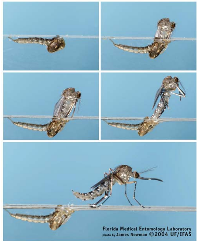
Figure 5. Adult mosquito emerging from the pupa.

Most mosquitoes disperse relatively short distances but the flight range of mosquitoes varies widely with species and ranges from less than a hundred meters to tens of kilometers.