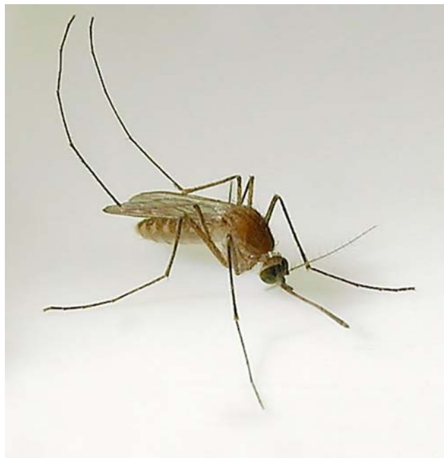
Figure 1. The Florida SLE mosquito Culex nigripalpus

Mosquitoes belong to the insect order Diptera, family Culicidae (Figure 1). The Diptera includes true flies, gnats, horseflies, blackflies, midges, crane flies, and others. Approximately 167 species of mosquitoes belonging to 13 genera are found in the United States; of these, 80 species occur in Florida. It is estimated that there are more than 2500 species of mosquitoes worldwide. Mosquitoes can be identified by noting that as all true flies they only have one pair of functional wings (most insects have two), and that