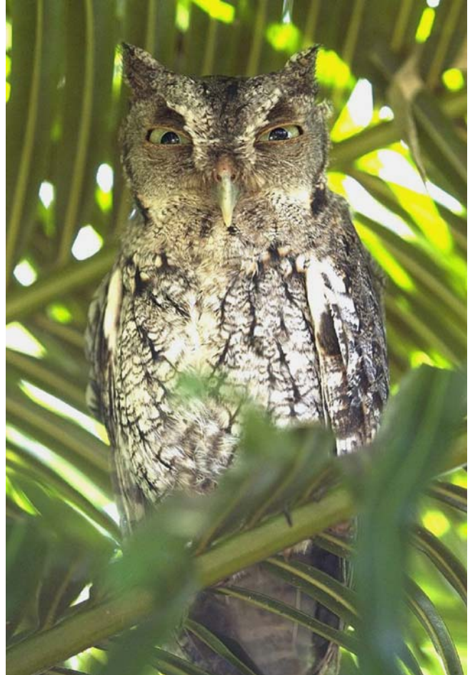
Figure 7. Owls, martins and bats do not control mosquito populations.