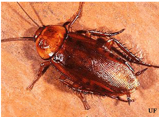
Figure 3. Brown cockroach (actual size, 1 1/2").