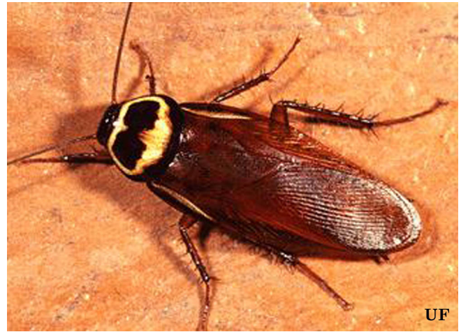
Figure 4. Australian cockroach (actual size 1 1/2").