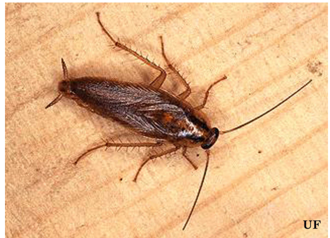
Figure 5. German cockroach (actual size 5/8").