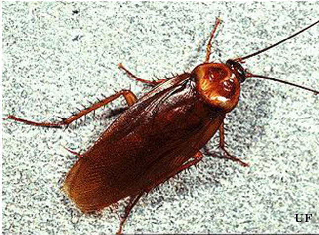
Figure 1. American cockroach (actual size, 1 1/2").