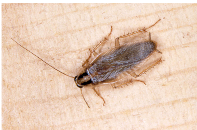
Figure 7. Asian cockroach (actual size 5/8").

the capsule of the German cockroach, but capsules of other cockroaches may have only 10-28 eggs.