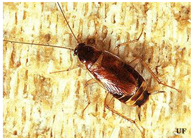
Figure 6. Brownbanded cockroach (actual size, 3/4").

surface by the female as soon as it is formed; however, the female German cockroach carries the